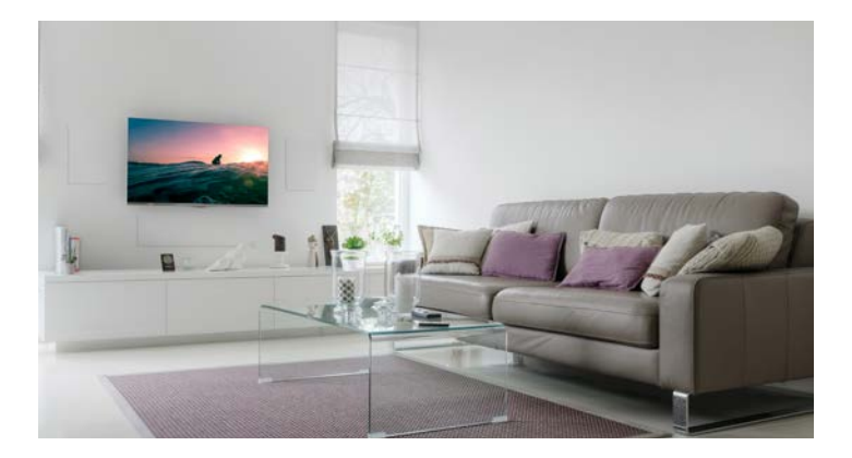
Bowers & Wilkins' nearly invisible Custom Installation speakers are made by the same team as their world renowned in-room models and offer the same level of performance.

High Performance Solutions for any Application