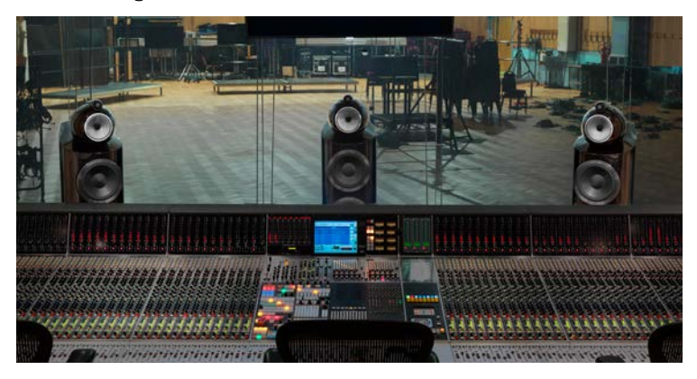
From Abbey Road to Skywalker Sound, professionals all over the world trust Bowers & Wilkins to deliver music the way the artist intended.