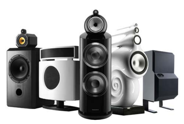
Bowers & Wilkins is a global leader in sound with over 50 years experience in making the very best audio equipment in the world.

High Performance Solutions for any Application