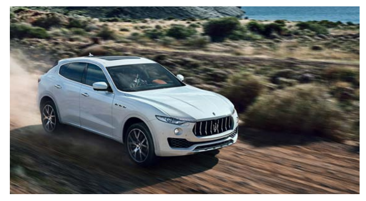
Bowers & Wilkins creates premium audio systems for some of the world's most prestigious car brands like BMW, Maserati, McLaren and Volvo.